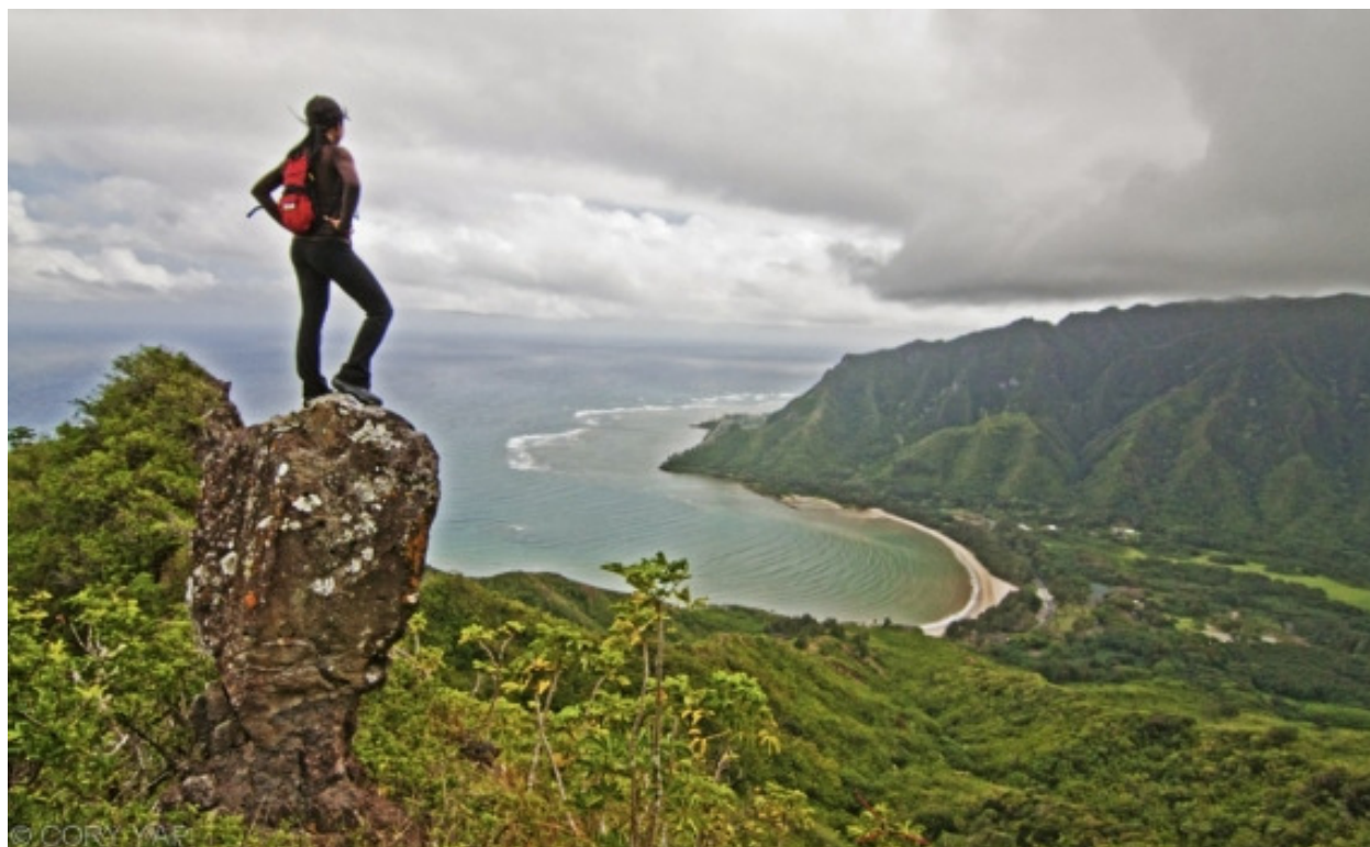
Climbing in Hawaii