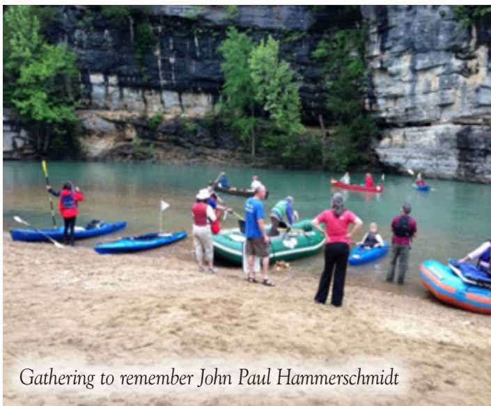
Gathering to remember John Paul Hammerschmidt

It was a wonderful tribute and I think John Paul would have enjoyed the day as much as we did.