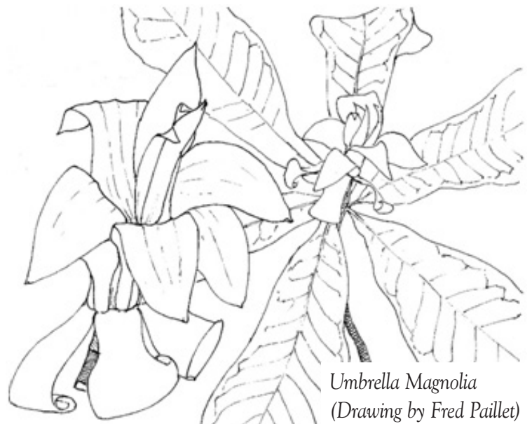
Umbrella Magnolia (Drawing by Fred Paillet)

stirred the pot long enough; time to hit the trail. I hope to see you on it.