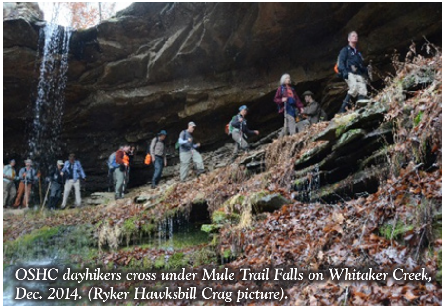
OSHC dayhikers cross under Mule Trail Falls on Whitaker Creek, Dec. 2014. (Ryker Hawksbill Crag picture).