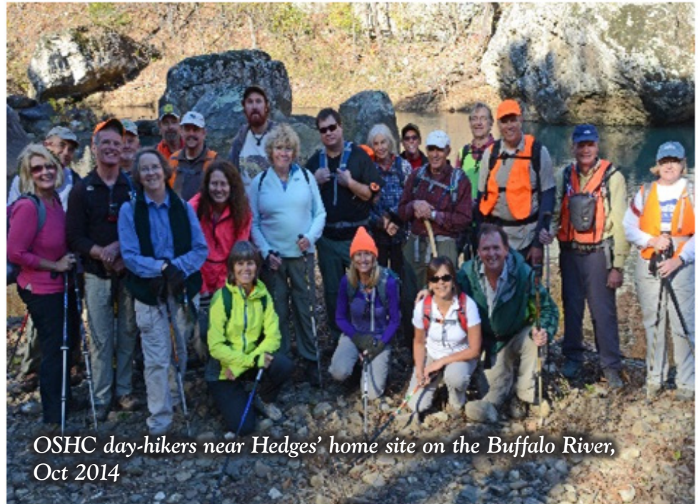
OSHC day-hikers near Hedges' home site on the Buffalo River, Oct 2014

Of the 29 outings, a mix ranging from easier trail hikes to more challenging "bushwhack"