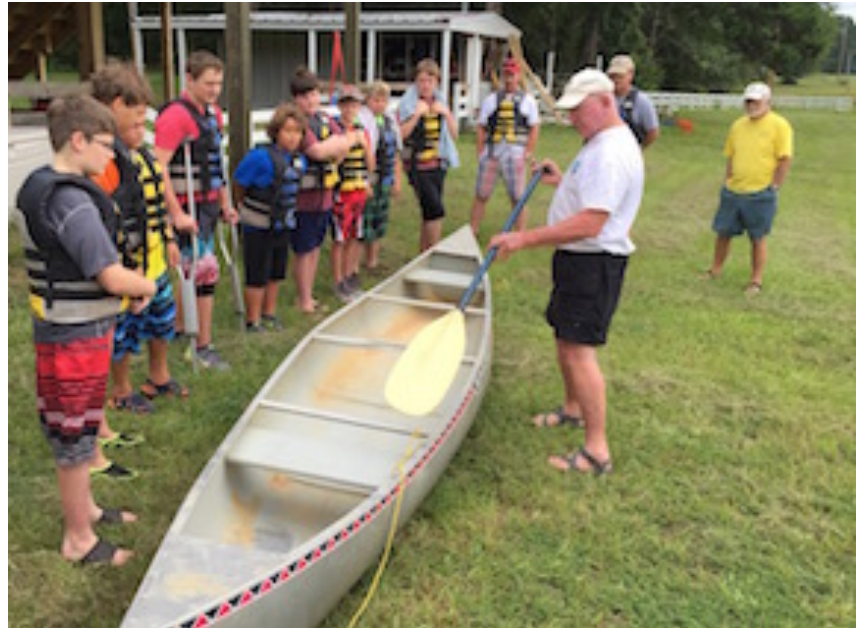
August 26, 2017 at Boy Scout Camp