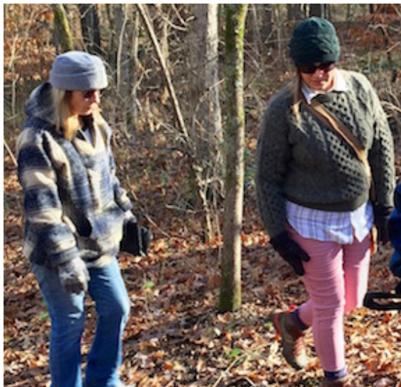
St. Matthias Episcopal Church Trail Hikers - January 24, 2019

Please let the newsletter staff know of any special days we may have missed.