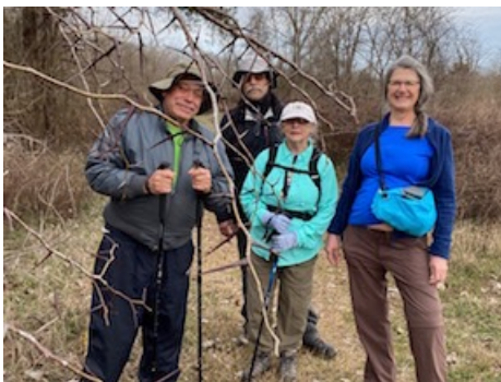
Above: St Matthias Trail Hikers