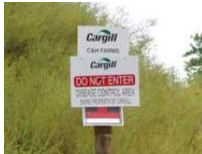
Photograph of Sign at C&H

C&H is contracted with Cargill, one of the world's largest privately-owned businesses, which had sales and other revenues of $136.7 billion in fiscal year 2013 alone. 4 Despite this, C&H put taxpayers on the line for $3.4 million in federal loan guarantees in order to obtain a loan for construction. 5