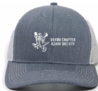
white thread on front of grey/white hats.