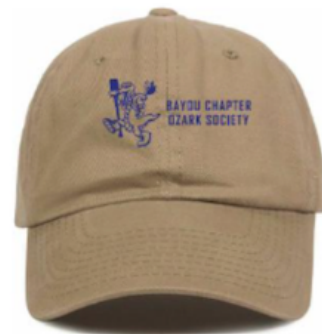
Royal thread on front of khaki