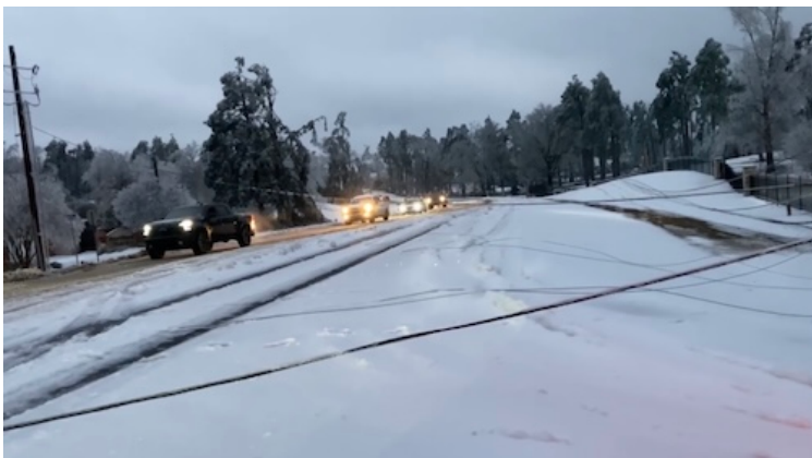
Downed Power Lined Near Melissa's House