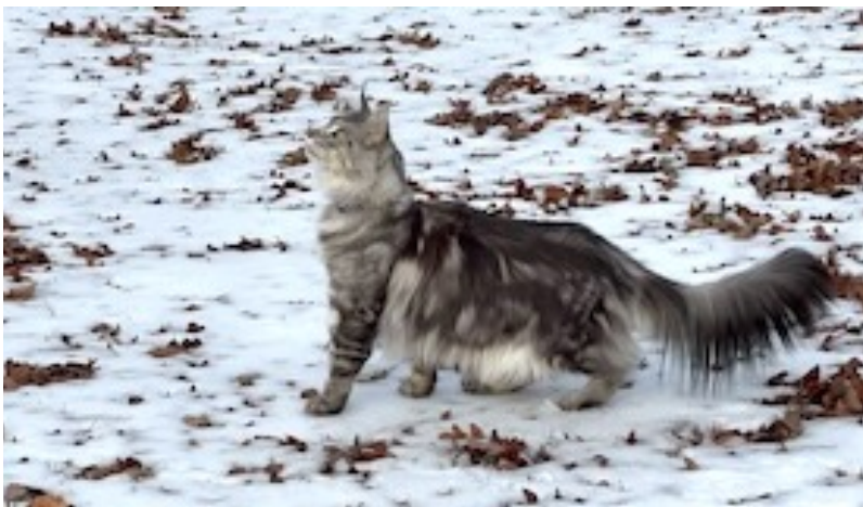
Freddie Mercury Frost Squirrel Hunting