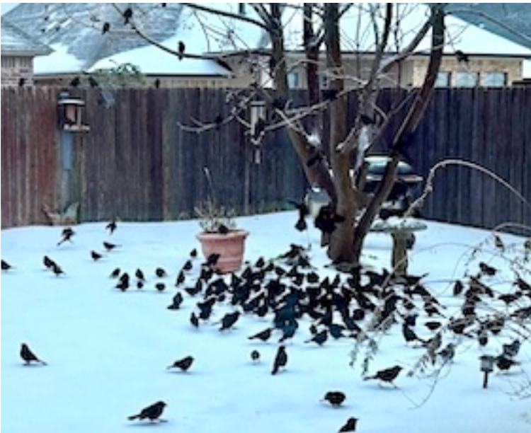
Tricia's Backyard Birds