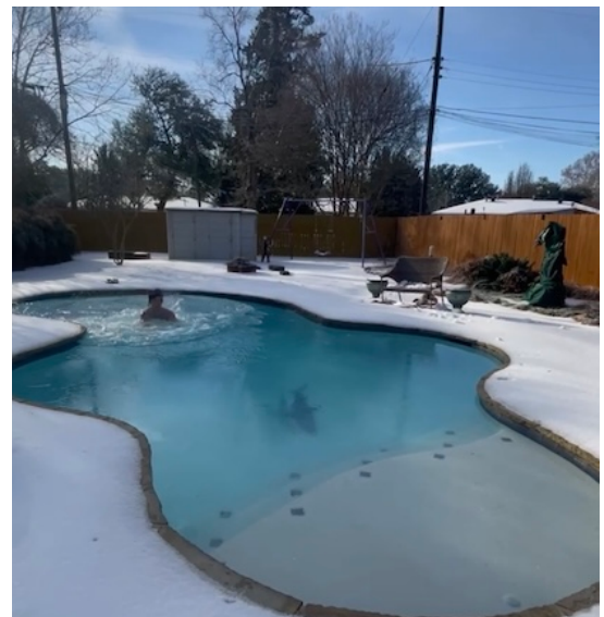
Barbie's Backyard Polar Plunge