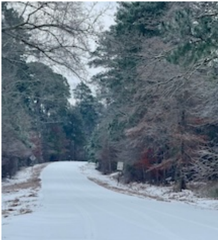
Icy Roads at Wendy's House in Plain Dealing

I'M TIRED OF WINTER! I WANT TO FAST-FORWARD TO COMPLAINING ABOUT HOW HOT IT IS!