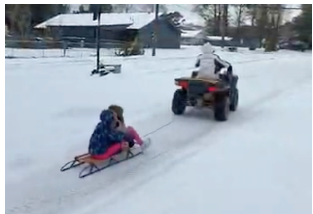
Wayne's Family Playing in the Sleet/Ice