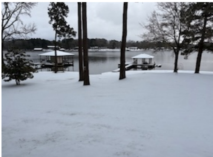
Dee and Tim's Backyard