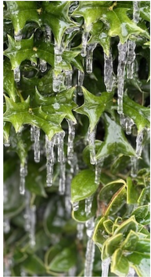
Icicles at Wendy's House