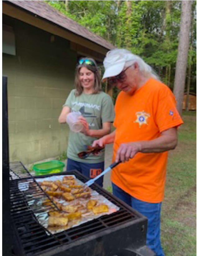
OWL Trail Maintenance - Well done, BCOS!!!